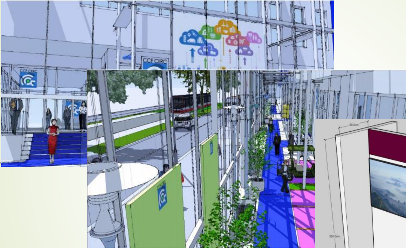
Single display panel