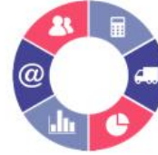
Enterprise Resource Planning