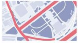
Geographic information system